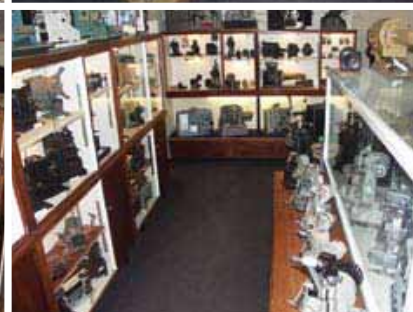
Views of the projection room. 1. Dick Gardner at the rewind bench. 2. Kalee 21. 3. Cinemeccanica Victoria 10. Bottom: Two views of the equipment room, absolutely packed with projection kit of all sizes

to bring back the atmosphere of cinema going in the past. Despite the relatively small size, quite a number of interesting and fine examples of cinema projectors flank both sides of the cinema. Included (pictures below) is a BTH Sound on Disc Projector, circa 1929, consisting of a Kalee Model 11 picture head and Kalee Model HL arc lamp. The projector and its twin were still in regular use at The Palace cinema in Bridport, Dorset in the 1960s – a tribute to the English manufacturer British Thomson-Houston. The 16 inch (40.5cm) shellac record was synchronised with the picture mechanically and the record was played at 33 & 1/3 rpm. At the start of the reel the needle was placed on a mark at the centre of the disc, lined up with a mark on the film in the gate and lasted 8–10 minutes.