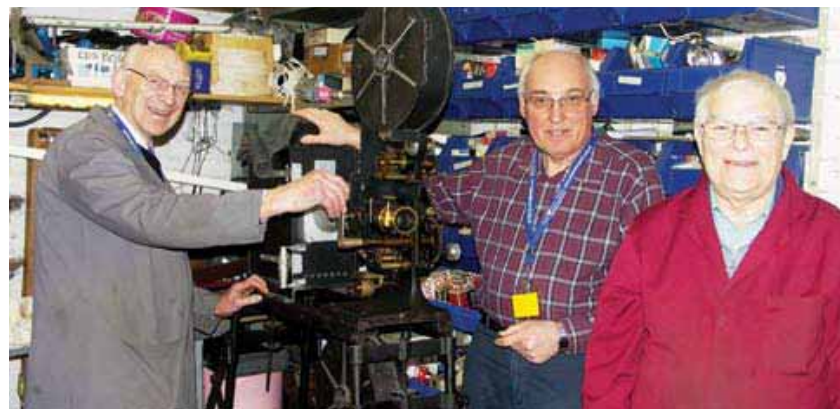
Top: The PPT archive and data bank has around 3000 records, including magazines and instruction manuals, and there are many spare parts for projectors, carefully stored away in drawers.